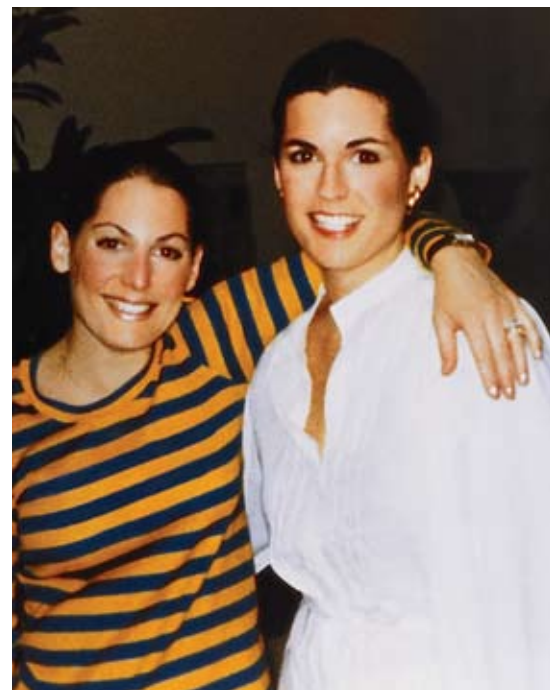
Susan G. Komen and Nancy Brinker